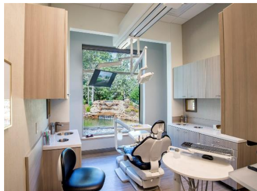
Each Operatory requires careful coordination.